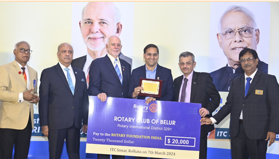
Recognition of TRF contribution to *Rotary club of Belur* at the Foundation Symposium and Recognition at ITC sonar Kolkata, on

Vol. 57 no 20 • Saturday 23 rd March 2024