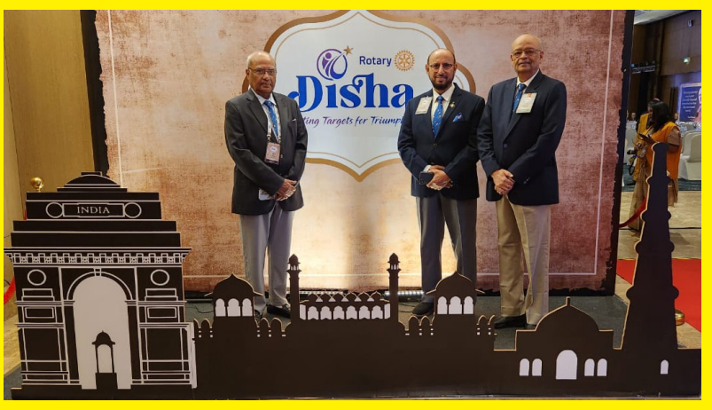
Launch of Disha - the goal- setting assembly for Rotary in India & Nepal